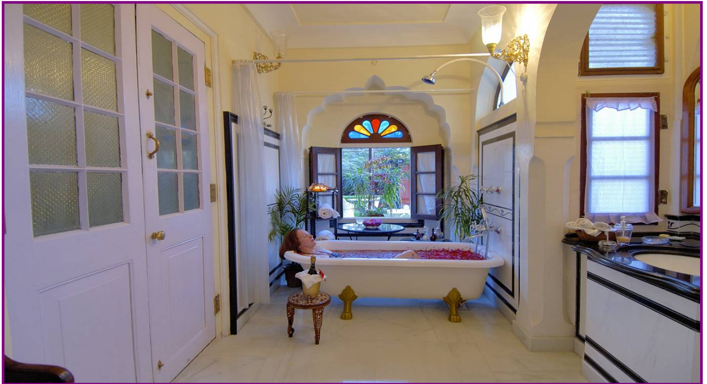
Bathtub in the bathroom