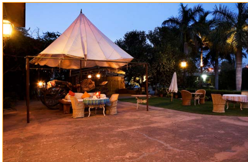
T The courtyard

A candle-lit dining can be arranged in the large front courtyard of the palace surrounded by open space along with puppet show and live music for the guests to enjoy a calm evening. Second option for dining is “ Savera-A pool side restaurant “ which is decorated with old pictures and old furniture ensuring personalize and cozy ambiance to the guests.