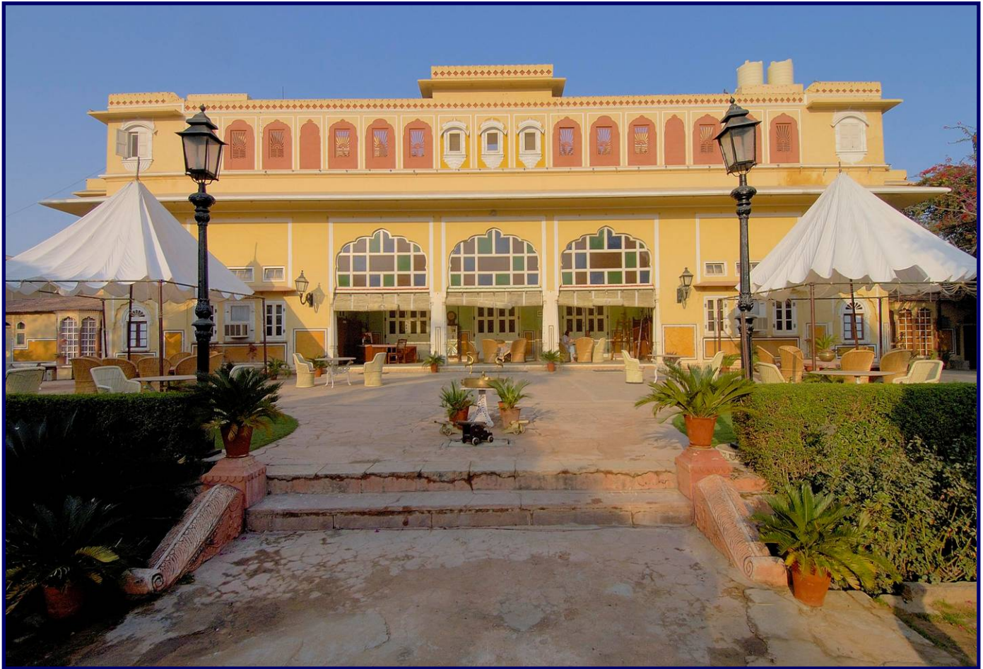
Front view of Palace

The 18 th century residence of Thakur Fateh Singh Ji Naila which dates from 1872 has been converted into a heritage palace located within the heart of Jaipur.